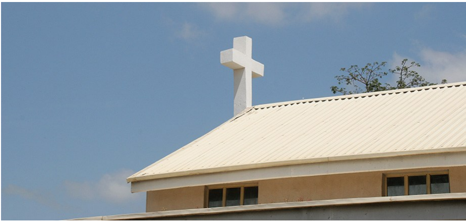
Churches in northern Nigeria are having to spend increasing money on security, because of the fear of violence (representative image)