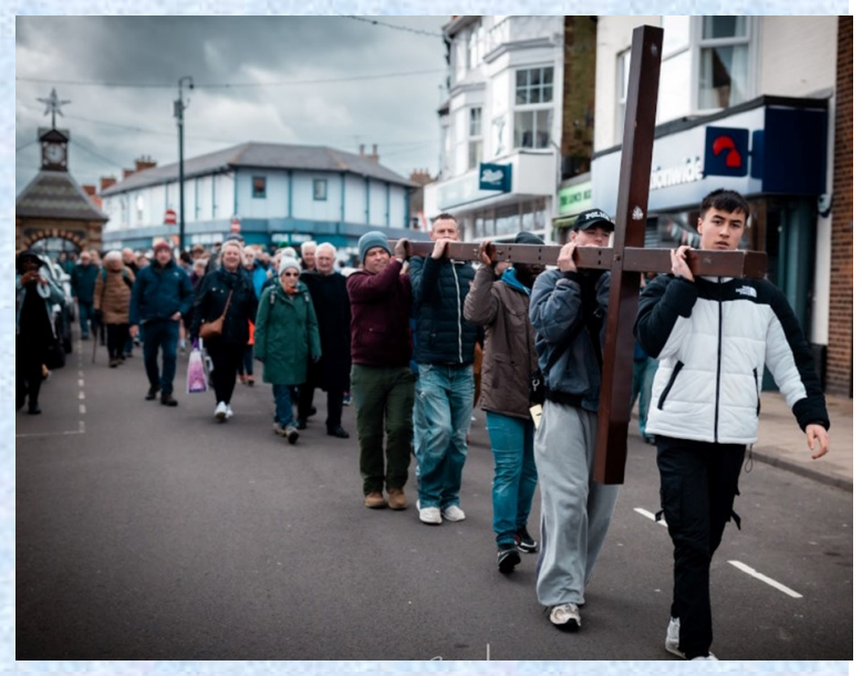
For more information about Christian events click on <u>https://www.networknorwich.co.uk/</u>

The cross was then erected and secured on top of the hill, and a time of worship followed, remembering the sacrifice made by Jesus for the salvation of the world. The cross will remain in position throughout the Easter period as a visible reminder of the significance of the weekend.