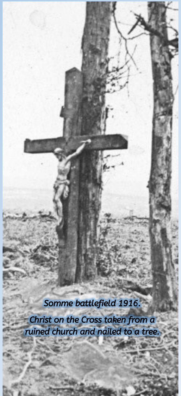
Somme battlefield 1916.

If you are reading this newsletter as a PDF or online you can click on the red highlighted links and you will be taken to the relevant websites.