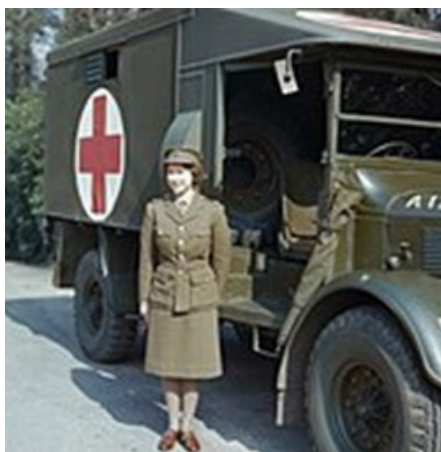
In Auxiliary Territorial Service uniform, April 1945

In 1943, Elizabeth undertook her first solo public appearance on a visit to the Grenadier Guards, of which she had been appointed Colonel the previous year. [30] As