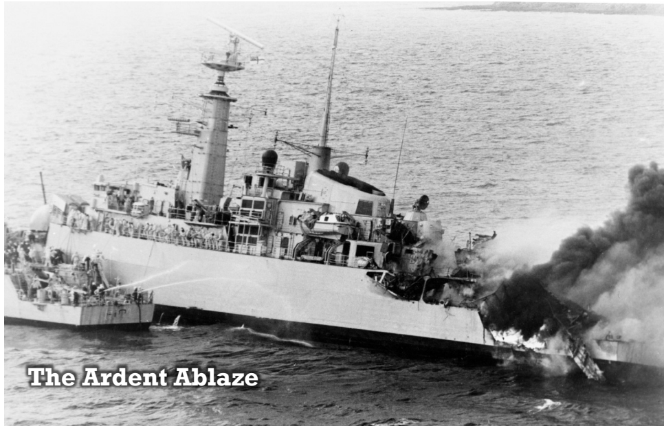
The Ardent Ablaze

motivated by religious persecution, but a significant number of those men, women and children were murdered because they follow Jesus.