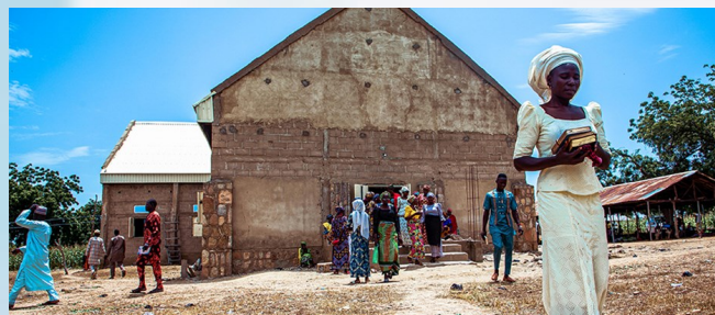
Your prayers for vulnerable Nigerian Christians are urgently needed