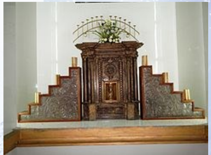
Tabernacle at the Santa Cruz Catholic Church, Ilocos Sur Philippines

Today, the Feast of Booths, or Tabernacles or Sukkot, is celebrated by a growing number of groups, including Messianic Jews, Church of God groups, and Apollo Quiboloy's Kingdom of Jesus Christ church in the Philippines, as well as the International Christian Embassy Jerusalem (ICEJ).