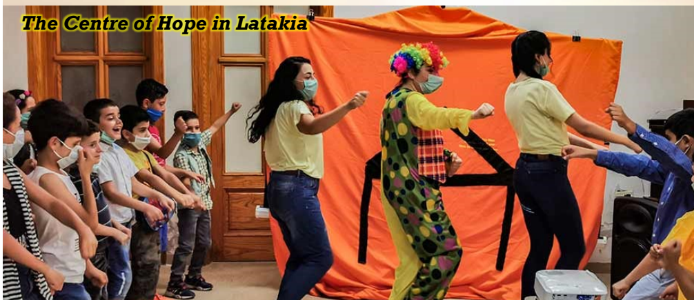
The Centre of Hope in Latakia