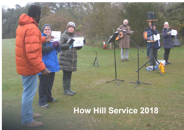
How Hill Service 2018

On Good Friday the 19th April there is a "Joint Service" at St Mary's Church at 2.00pm. Later in the evening 7.00pm there will be a "Reflective Service" at SBC.