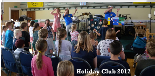
Holiday Club 2017

Big thank you to all the folk who have worked every morning with the wonderful children attending holiday club. To the organizations and people who have loaned and donated resources and lovely food. Also a big thank you to the families of the children who can be very proud of them, they are a great credit to you all.