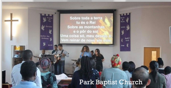
Park Baptist Church

On Sunday September 2nd SBC will be hosting a joint service with the Yarmouth Portuguese congregation of Park Baptist Church. So we will have a service in both languages followed by a shared lunch in the Stables.